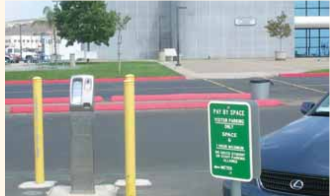
The SDCCD uses multibay meters to control the visitors parking which is mixed in with students.

At SDCCD, another important factor in the success of its multibay program is the automatic audit