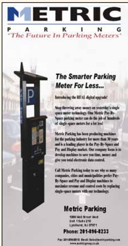
Circle #8 on Reader Service Card

Whether the paper roll is empty, the coin box is full or the battery has to be exchanged, the Phoenix transfers these service messages to the central computer within a few seconds. Maintenance work can be planned accordingly.