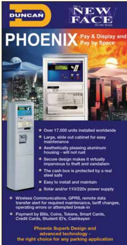
Circle #7 on Reader Service Card