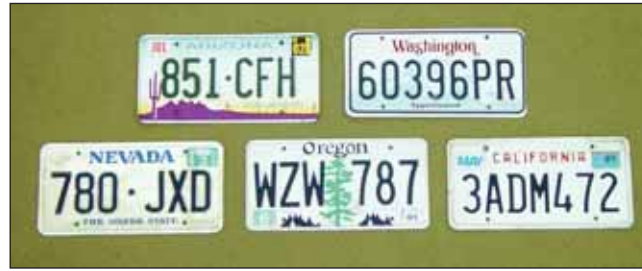
The license plate is read at the entry and the license plate number, along with the ticket/transaction number is sent to a central database.

Given the requirement for multiple license plate reads, this may seem a more difficult task. But there are some things to consider that suggest it may, in fact, make the task of accurate plate recognition somewhat easier. Once the